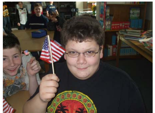
Jansen Students celebrate as they watch history being made with the inauguration of our new President, Barack Obama.